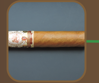
Opt for a light cigar, such as a Dominican Connecticut, known for its mildness. Retain about 50% of the smoke

For those of you who have never done it, here are the steps and the JMB technique to do it.